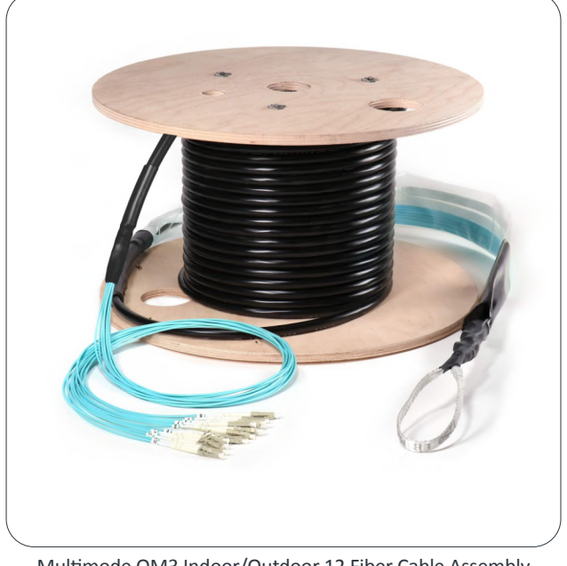
Multimode OM3 Indoor/Outdoor 12 Fiber Cable Assembly showing LC Connectors and Pull Sheath

RLH Indoor/Outdoor cable assemblies are pre-terminated with LC, SC or ST connectors, and can be ordered in any length required. Cable assemblies include a pull sheath for ease of deployment on site. Each assembly is fully tested and includes a certification test report.