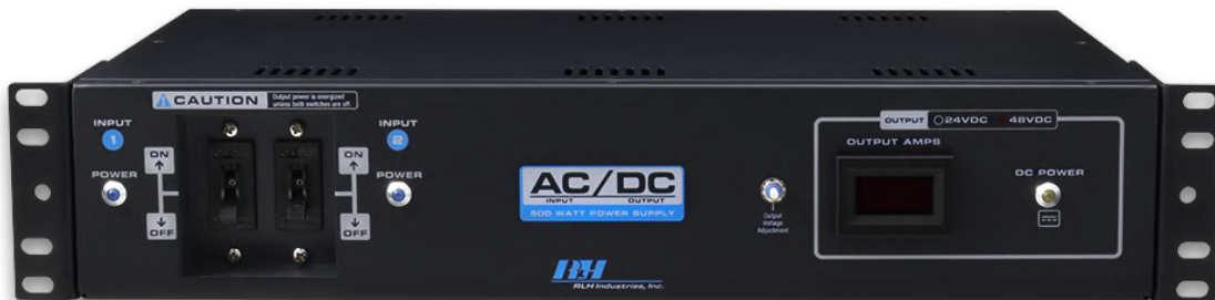
Front panel switches and indicators

Double check all connections. Apply power to the input wiring by turning on the source AC power breaker at the source panel.