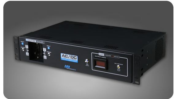
RLH 500 Series AC/DC Power Supply

The Series 500 AC/DC power supply is an EIA 19/23 inch 2RU rack mountable unit, with both front or telco center style rack ear mounting.