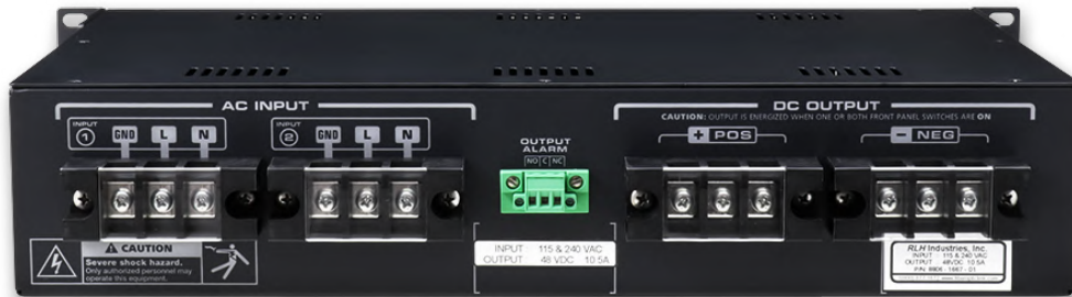
Rear panel connections

Check to make sure the front panel breaker switches are OFF. Connect a secondary (redundant) AC power source (if used) to INPUT 2.