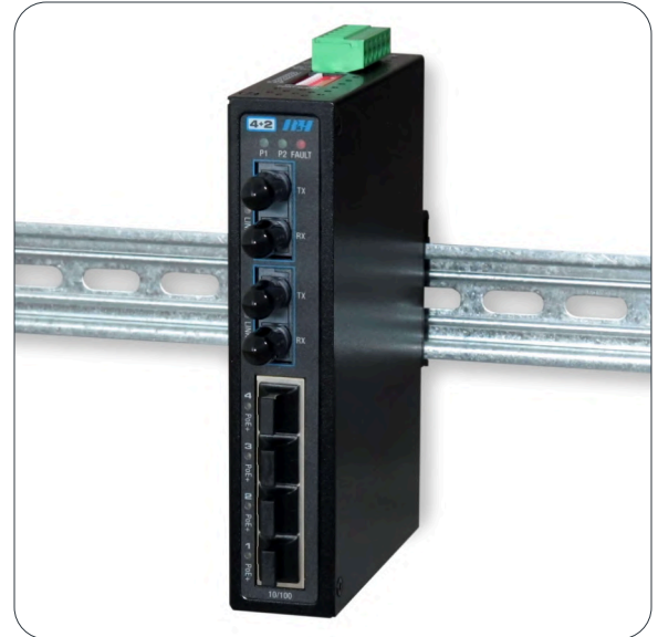
Industrial 4+2 Fiber PoE+ Switch

Our industrial switches robust construction and features meet the demands of a variety of applications, and are an ideal solution for a wide range of utility and automation environments.