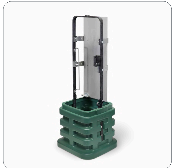
Backboard with cover removed