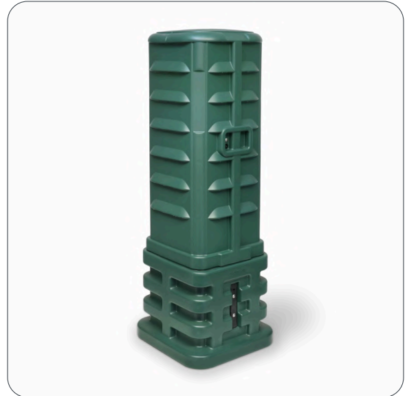
Type 02 Semi-Buried Pedestal